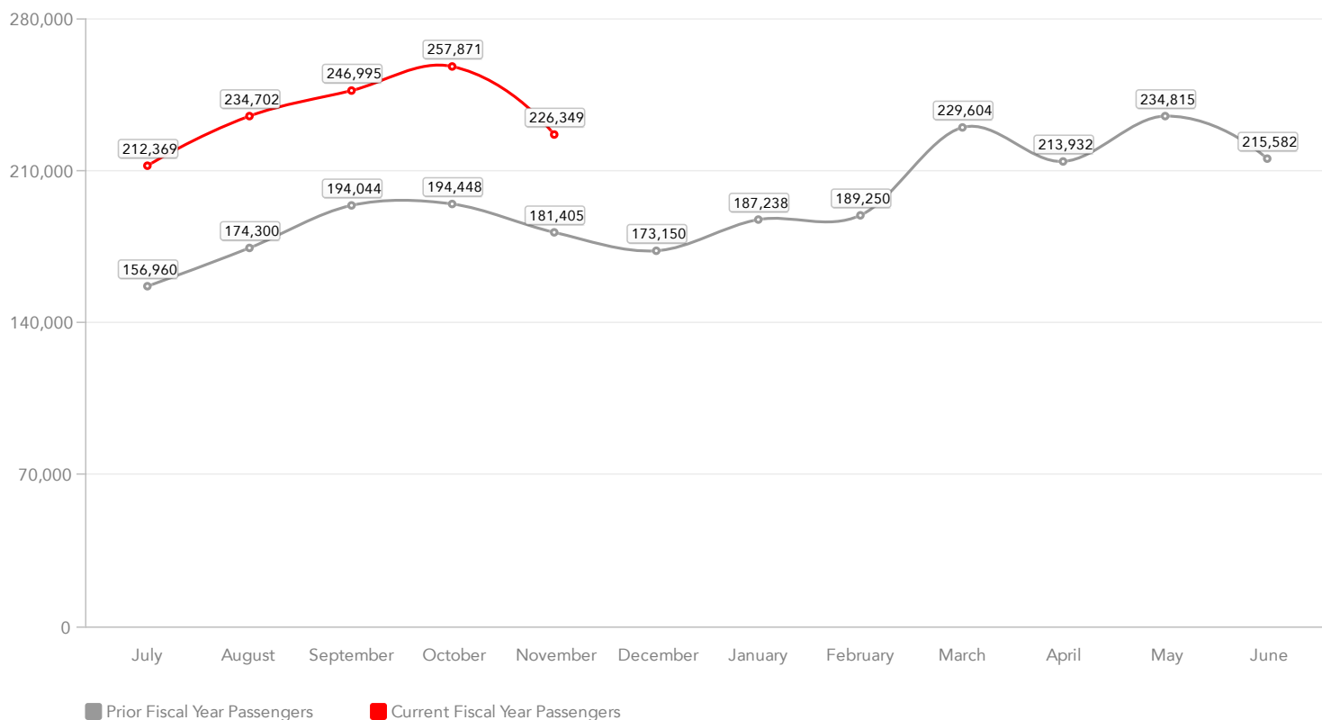
Demand Response Passengers by Month