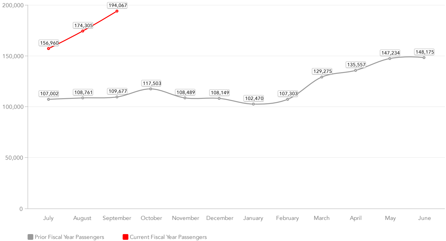
Demand Response Passengers by Month