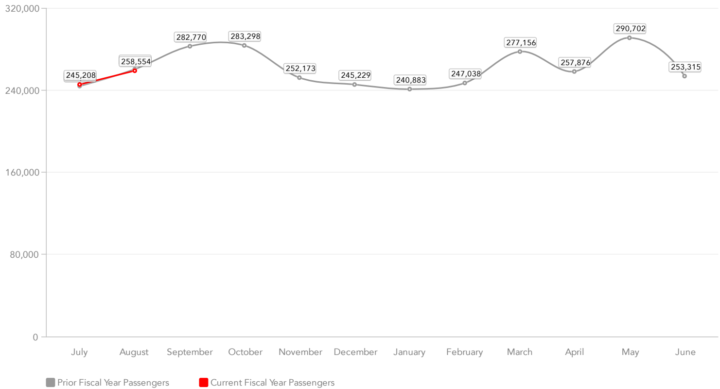
Demand Response Passengers by Month