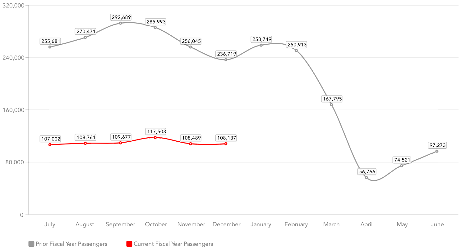
Demand Response Passengers by Month