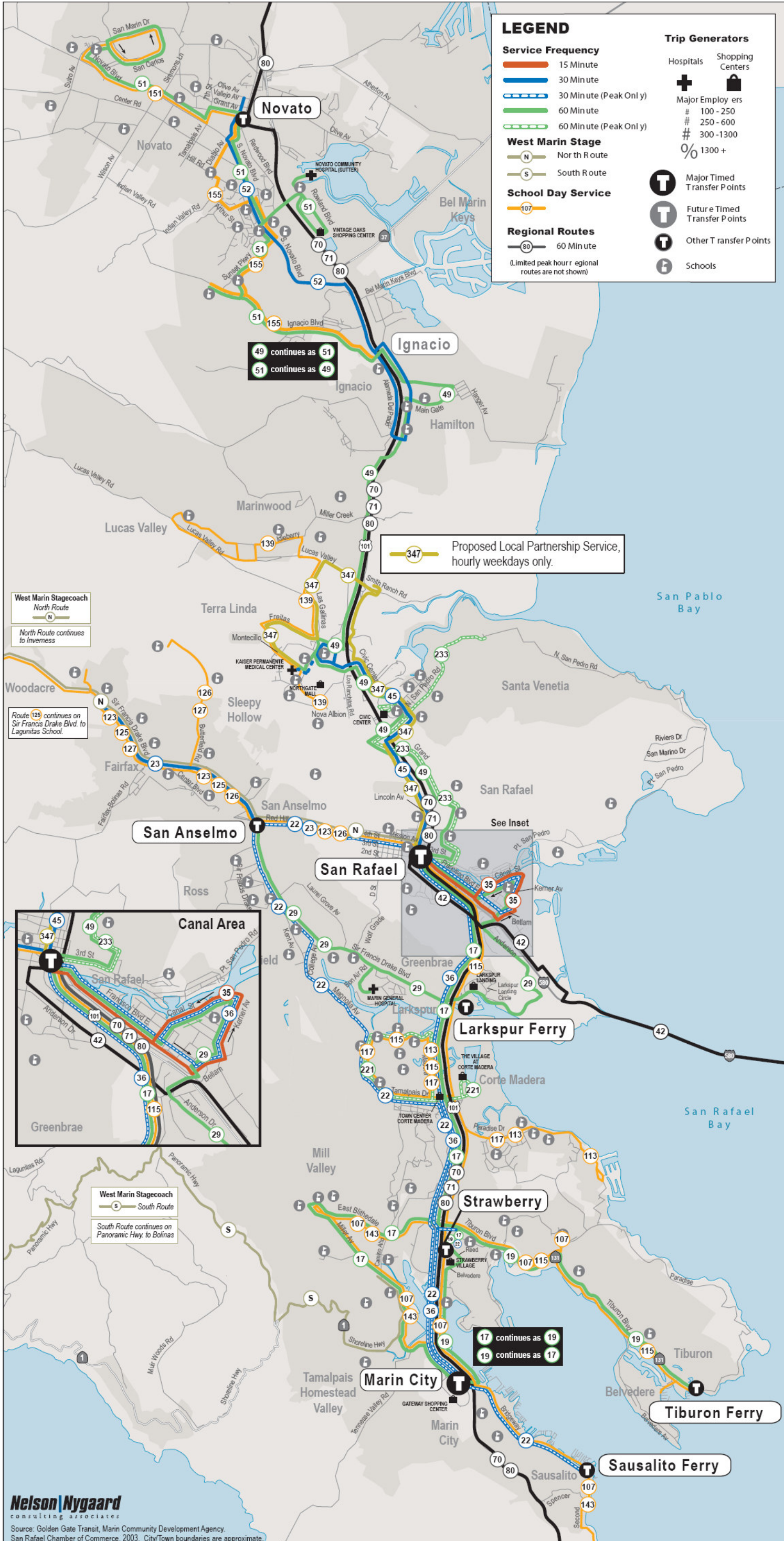
Figure 1: Map of Proposed Urban Fixed Route Services